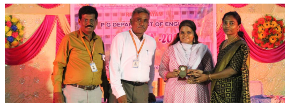
OSTARA Cultural Fest Organised by PG Department of English (S.F)