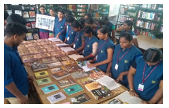
Book Fair conducted by New Century Book House in the Indoor Stadium & Book Expo in the Library in lieu of the 150th Birth Anniversary of Mahatma Gandhi