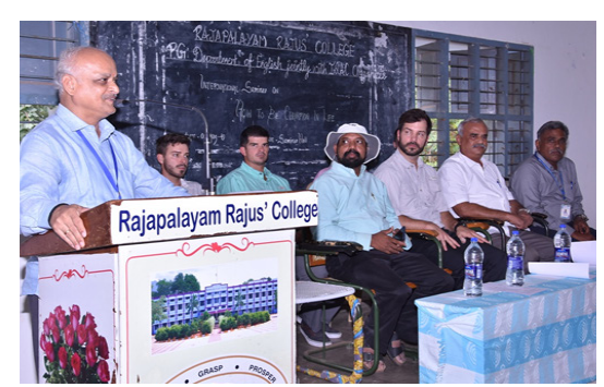
International Seminar on "How to be Champion in Life" Organised by PG Department of English (S.F)