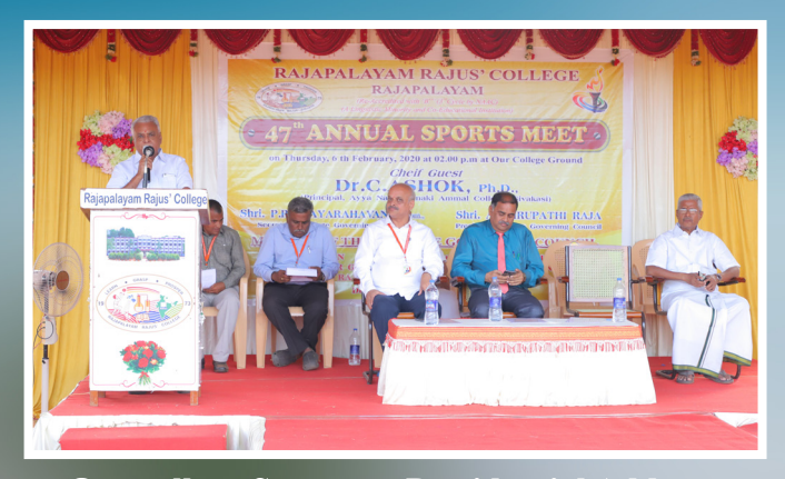
Our college Secretary Presidential Address