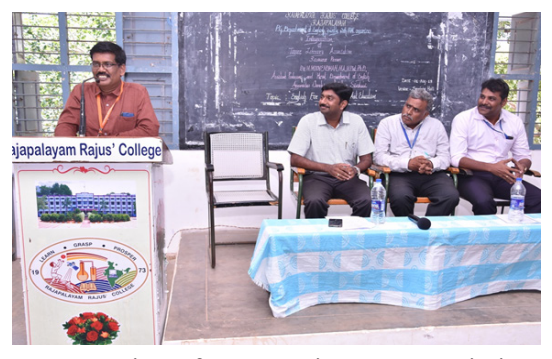
Inauguration of Tagore Literary Association Organised by PG Department of English (S.F)