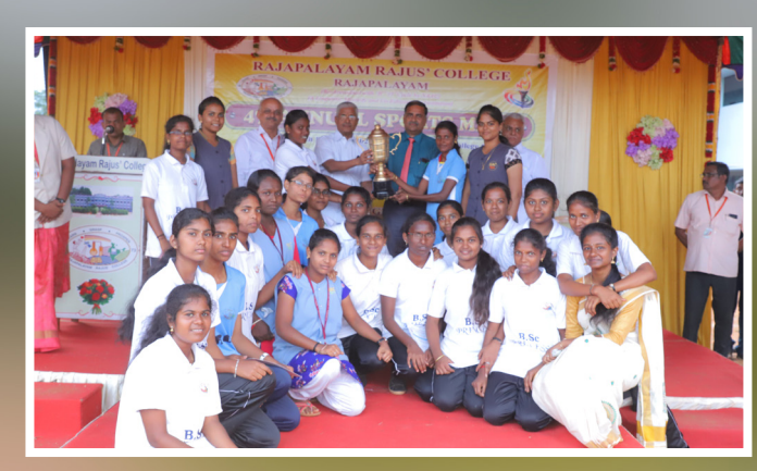
Overall Champion for Men (Bharathiyar House) - Women (Narmatha House)