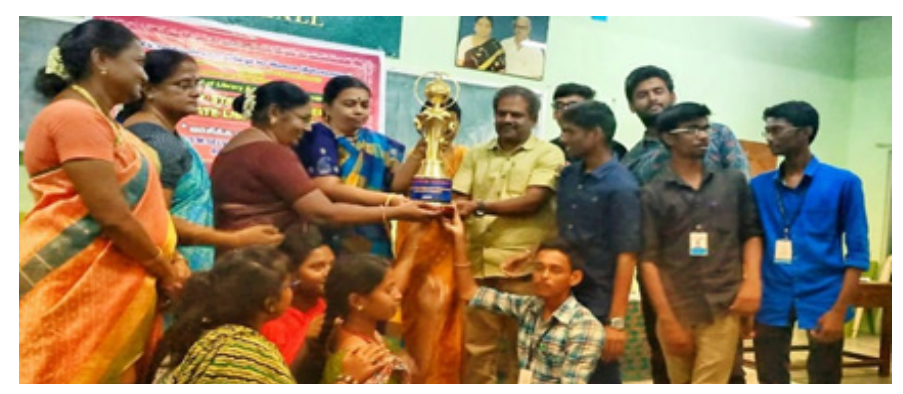
Readers Forum students won the Rolling Trophy for the second consecutive time in the One Day State Level Inter Collegiate Library Carnival- VAASIKKA VAANGA-2019 organised by VVV College, Virudhunagar