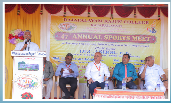
Our College President Felicitation Address